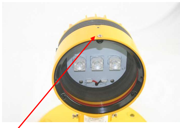
(Fig 3) align the brackets concaved area to this screw