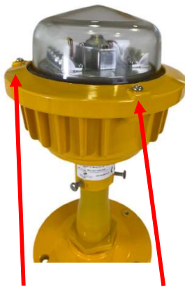
Mounted on these screws